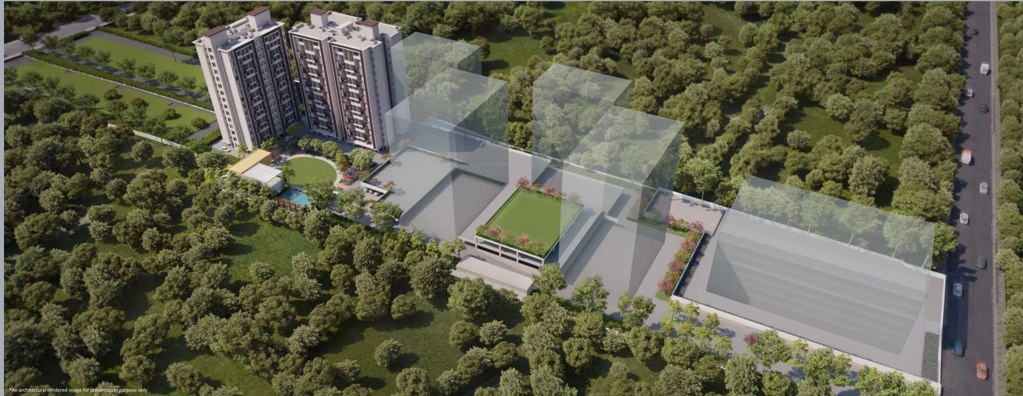
*An architectural rendered image for presentation purpose only