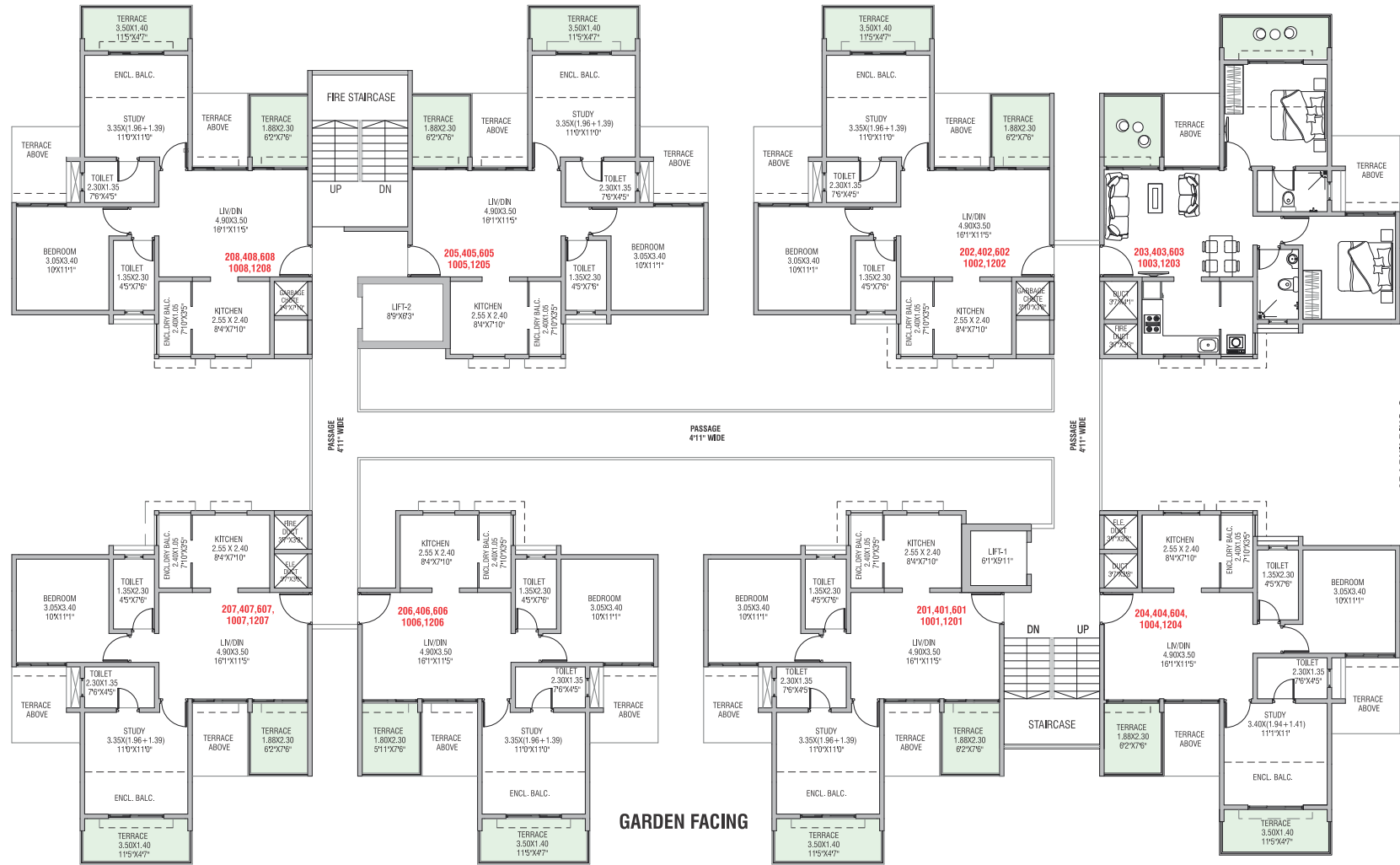
CARPET AREA AS PER RERA (IN SQ.M.)