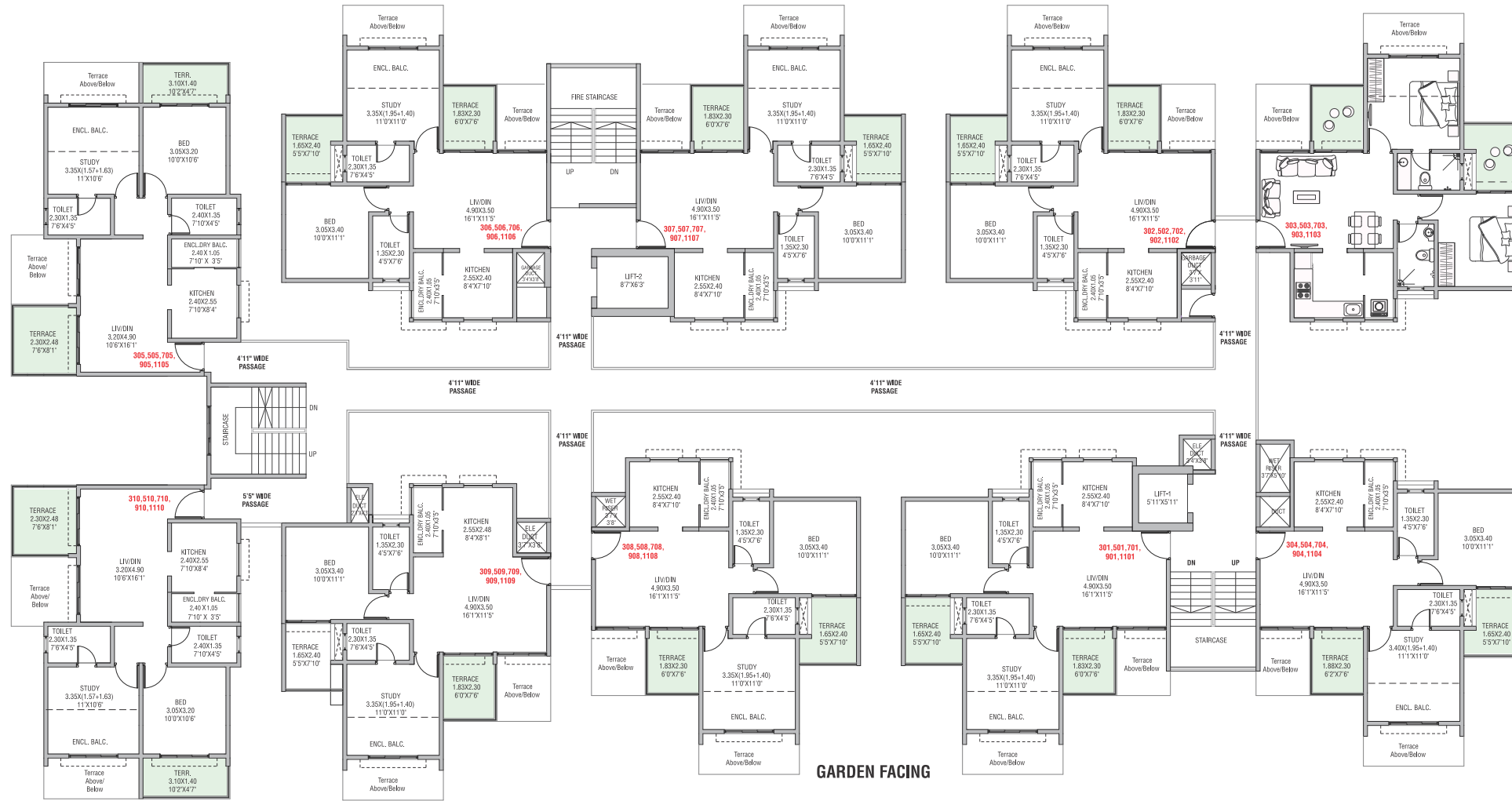
CARPET AREA AS PER RERA (IN SQ.M.)