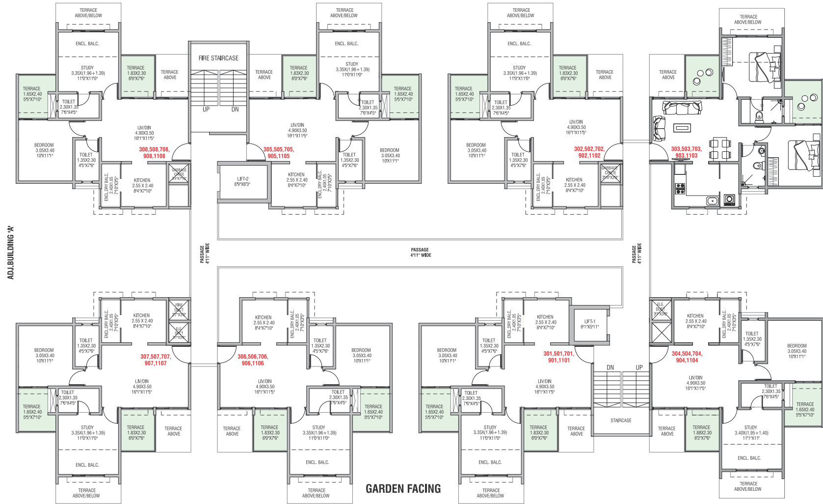
CARPET AREA AS PER RERA (IN SQ.M.)

Typical Odd Plans - 3 rd , 5 th , 7 th , 9 th , 11 th